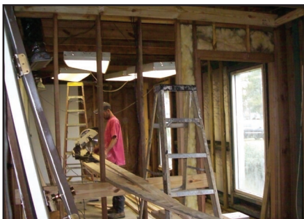
Jimmy Johnson's office undergoing renovation

The NPC Georgia Branch is presently undergoing a complete remodel of its office complex. Once the remodel is complete, the entire computer system will be upgraded and the conference room will boast an all new video conferencing network system which will interface with our home office in Glendale, AZ, thus allowing Georgia's branch to more efficiently perform its office functions. The remodel is projected to be complete First Quarter of 2010.