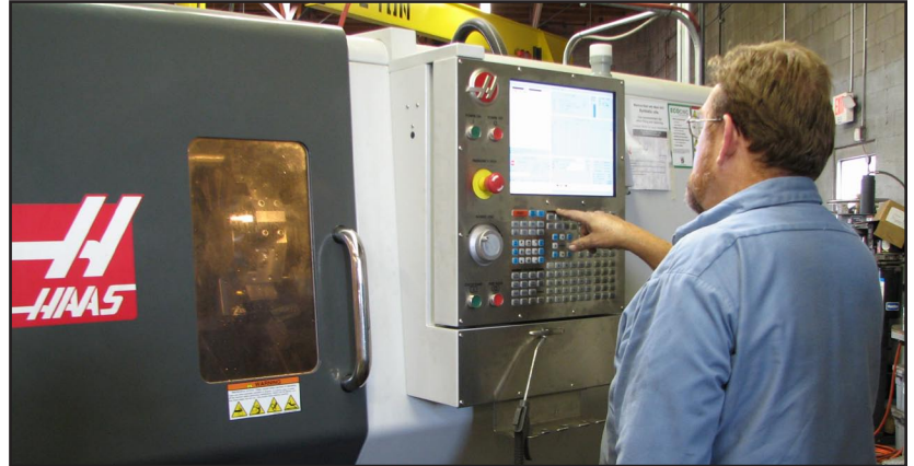
Programming the CNC lathe.

Our production area recently added two pieces of equipment to our arsenal of tools, helping NPC to “Deliver More” to our customers. We have a new Hines Dynamic Balancer which is up and running, allowing us to “dynamic balance” our impellers, up to 20”. We have manufactured all the necessary mandrels to allow for balancing standard colleted impellers from 1” to 2-7/16” and the same with the “double key” shaft design, allowing us to improve deliveries by more than 3 – 5 days, as well as keeping control of our product and improve efficiency.