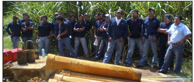
Photo at left: Installation with center pivot. Photo above: Guatemalan Pump School attendees.

EMSYA, NPC's representative for agricultural sales in Guatemala has been a driving force in promoting NPC pumps. Their largest customer is a huge sugar cane growing operation in Western Guatemala. In December 2010 the sugar cane operation learned first-hand about NPC's promise of "Delivering More."